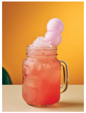
DOWN TO EARTH

Fever Tree Ginger Beer, Lime Juice, Sugar Syrup